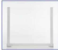
Small: 28" w x 28" h