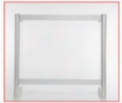
Small: 28" w x 28" h x 12" d